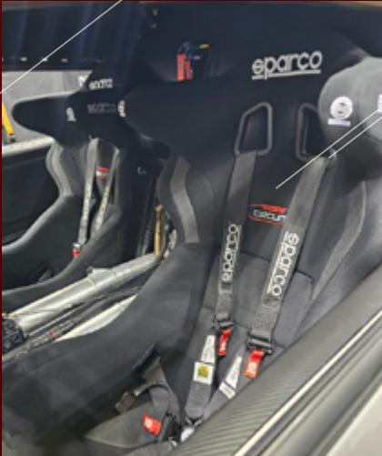
SEATS AND HARNESSES

THE WINNING CHOICE FOR MOTORSPORT EQUIPMENT