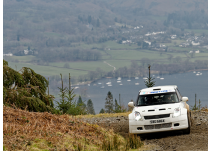
Callum Black & Jack Morton