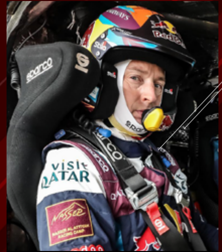
RACEWEAR AND HELMETS