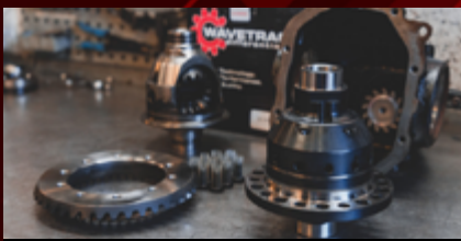
LIMITED SLIP DIFFERENTIALS