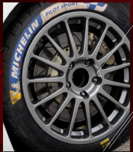
WHEELS AND TYRES