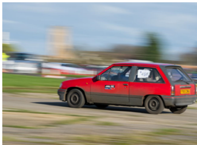
Richard Yapp