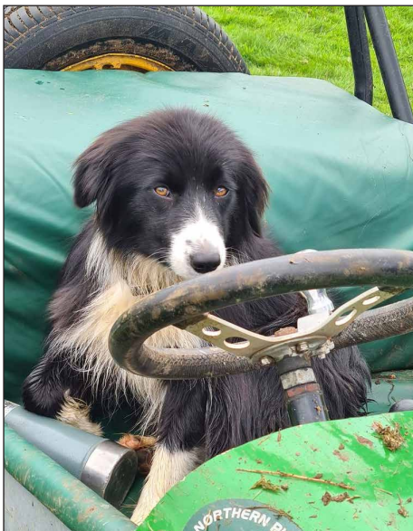
Rookie drivers are getting more impressive!