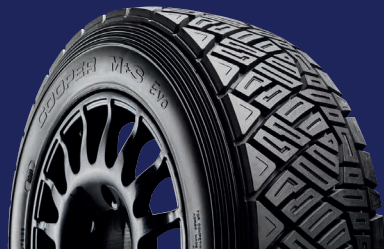
COOPER M+S EVO

CONFIDENCE-INSPIRING PERFORMANCE FOR THE MOMENTS THAT COUNT