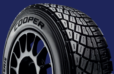
COOPER DISCOVERER GRAVEL DGI