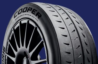
COOPER DISCOVERER TARMAC DT1