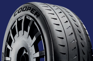
COOPER DISCOVERER TARMAC DT02