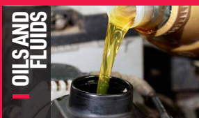
OILS AND FLUIDS