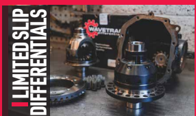
LIMITED SLIP DIFFERENTIALS