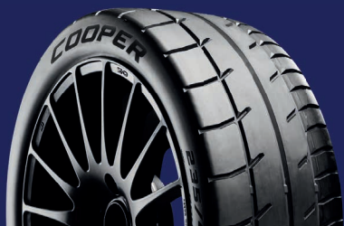
COOPER RALLY CLASSIC TARMAC CTO1