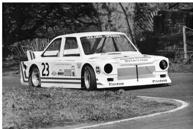
Golden Springs on the hillclimb scene

The venue is Woolminstone, as used in previous years. This is located south of the A30 between Crewkerne and Chard. Our friends at Windwhistle Motor Club are running their championship event on Saturday 29 th April; we hope the double-header weekend will attract some of you to the West Country. Nearby accommodation can be found at the following websites: -