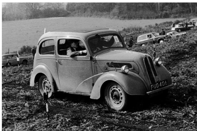
Trialling 1960s style, note the jacket and tie!